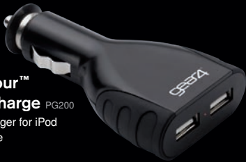
RoadTour™ Dual Charge PG200 In-car charger for iPod and iPhone