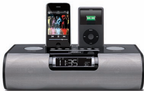
CRG-200W PG435 Dual dock alarm clock radio for iPod and iPhone