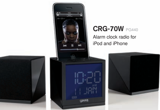
CRG-70W PG440 Alarm clock radio for iPod and iPhone