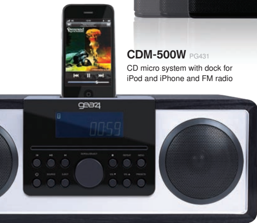
CDM-500W PG431 CD micro system with dock for iPod and iPhone and FM radio