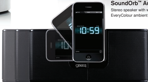
StreetParty™ Revolve PG466 Portable speaker for iPod and iPhone