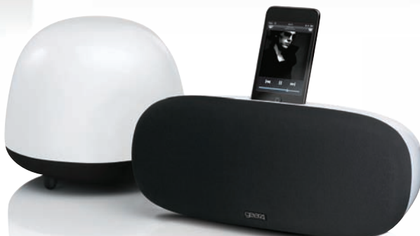
SoundOrb™ Aurora PG448 Stereo speaker with wireless sub-woofer and built-in EveryColour ambient light for iPod and iPhone