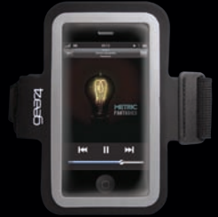
Sports Armband PG690 Adjustable sports armband