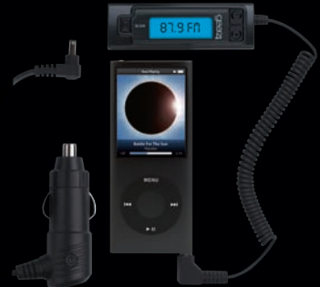
AirZone™ FM PG463 Universal FM transmitter