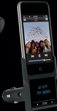
CarDock™ FM Follow Me PG361 In-car FM transmitter for iPod and iPhone