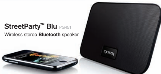
StreetParty™ Blu PG451 Wireless stereo Bluetooth speaker