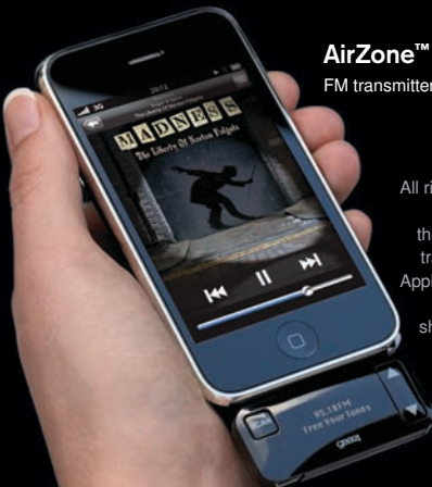
AirZone™ FM Follow Me PG360 FM transmitter for iPod and iPhone

All rights reserved. Reproduction in whole or in part is prohibited. GEAR4 and product names are trademarks of Disruptive Ltd. The Bluetooth word mark and logos are owned by the Bluetooth SIG, Inc., and any use of such marks by Disruptive is under licence. iPod is a trademark of Apple Inc., registered in the US and other countries. iPhone is a trademark of Apple Inc. All other product names are or may be trademarks of and used to identify products or services of their respective owners. Brands are used for illustration purposes only and should not be used to infer any relationship between GEAR4 and respective owners. Made for iPod means that an electronic accessory has been designed to connect specifically to iPod and has been certified by the developer to meet Apple performance standards. Works with iPhone means that an electrical accessory has been designed to connect specifically to the iPhone and has been certified by the developer to meet Apple performance standards. All details correct at time of going to print: February 2010