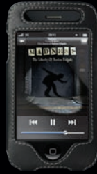
LeatherJacket™ PG680 Premium grade leather case