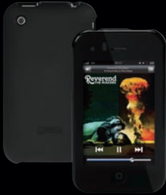
BlackIce™ PG674 Liquid rubber case with high gloss front