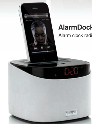
AlarmDock™ Reveal PG487 Alarm clock radio for iPod and iPhone