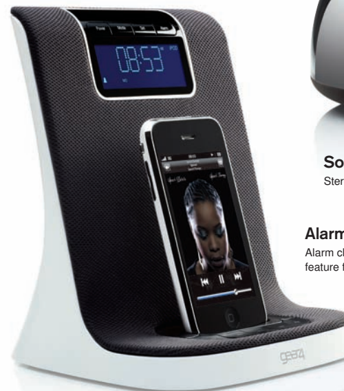
AlarmDock™ Halo PG490 Alarm clock radio with SmartDock feature for iPod and iPhone