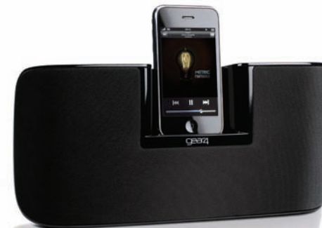
Explorer-SP PG433 Home portable speaker for iPod and iPhone