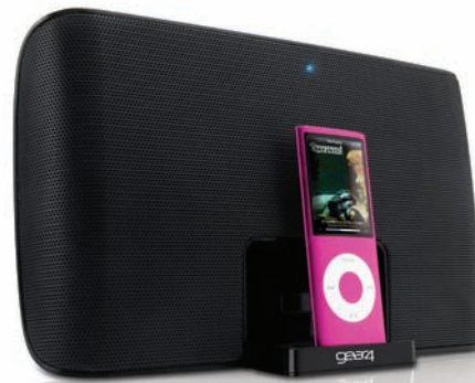
StreetParty™ 4 PG447 Portable speaker for iPod and iPhone