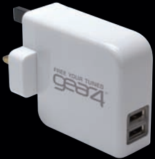
WorldTour™ Dual Charge PG106 Universal AC charger for iPod and iPhone