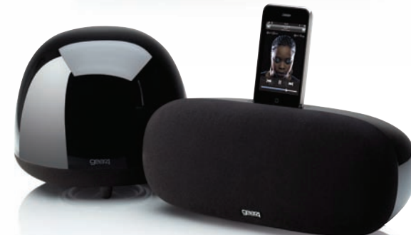
SoundOrb™ Nebula PG449 Stereo speaker with wireless sub-woofer for iPod and iPhone